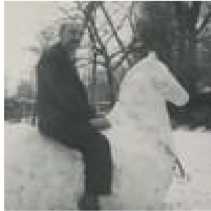
Persuaded by children to sit astride a snow horse, 1947