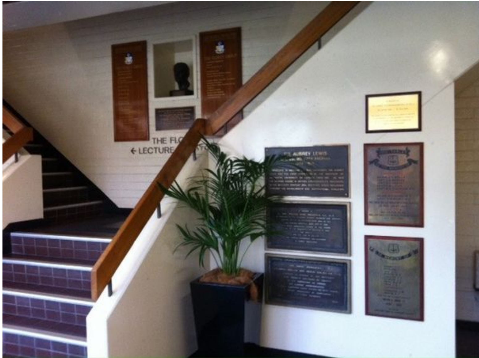
Foyer of Adelaide Medical school, 2016