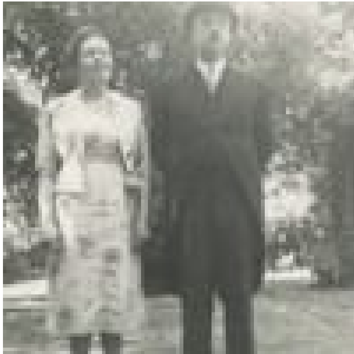
Prior to Knighthood, 1959