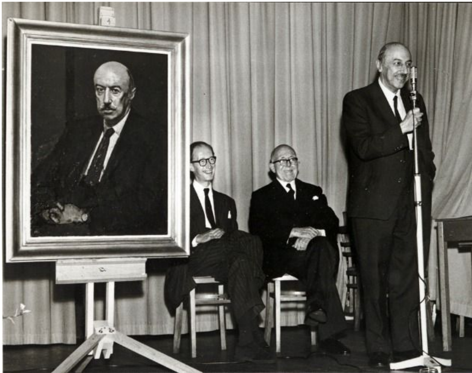
Retirement presentation, 1966